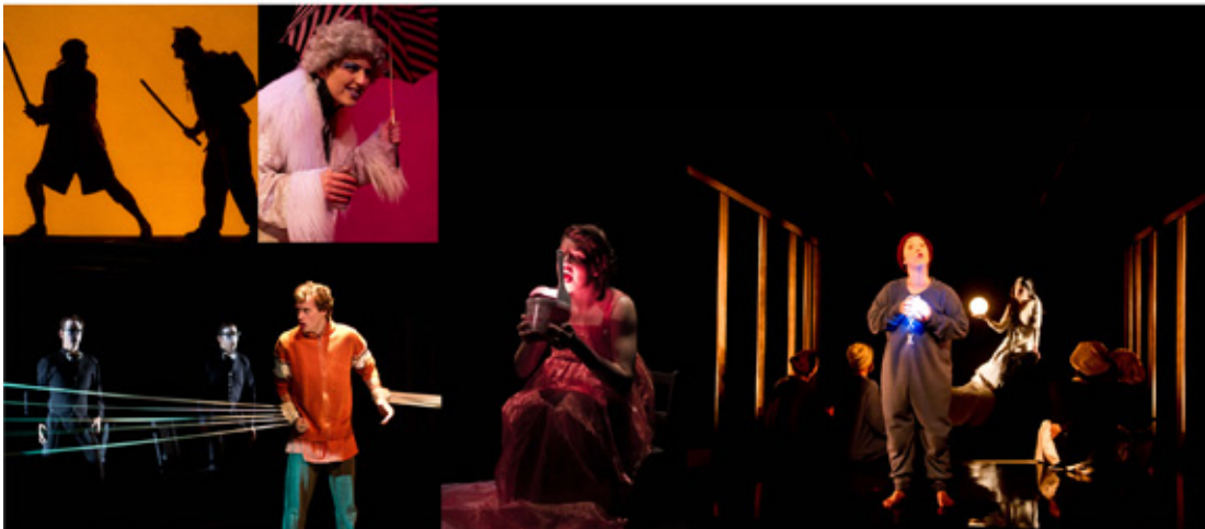
PRODUCTIONS: NOUS VOIR NOUS AND THEATRE FOR YOUNG AUDIENCES (CRÈME-GLACÉE, ANTOINE-LE-MUET, LES CHEVALIERS DE TERREBONNE AND LA VÉRITÉ SUR HONG-KONG)